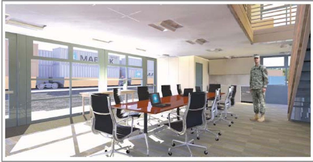
Inside a modular building

A fully functioning two-story office facility will be unveiled at the annual National Defense Transportation Association (NDTA) Forum at the Gaylord National Harbor Hotel near Washington D.C. on September 20, 2010. After the show, the 6-unit building will be moved to APM Terminals in Portsmouth, Virginia where it will be used as an on-terminal operations center.